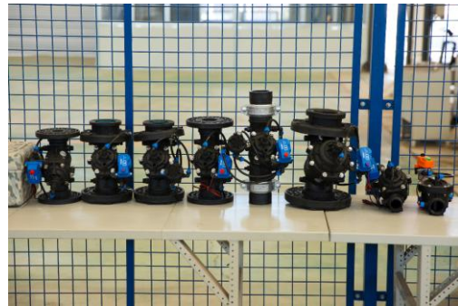
Raw Material Storage