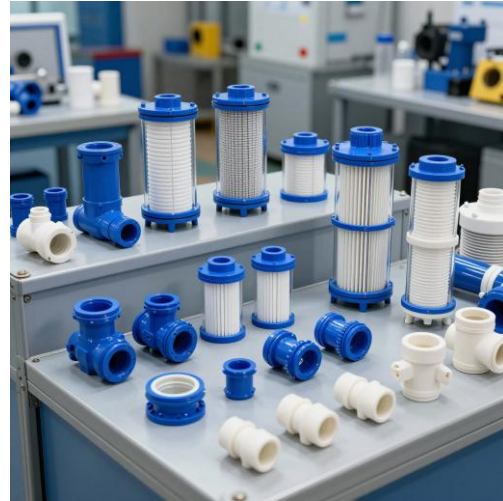
Filters & Accessories