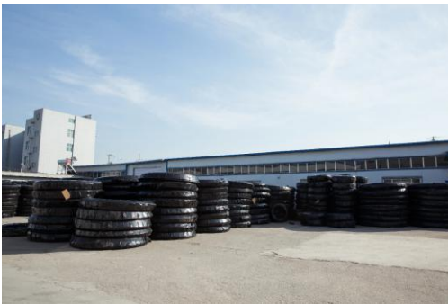
Warehouse & Stock